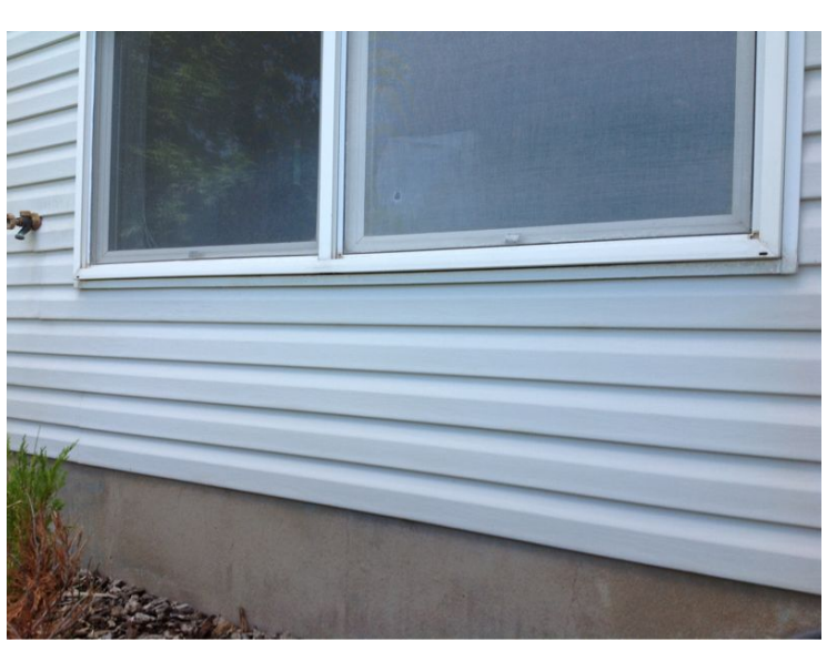
Window Screens in Inspection Checklist