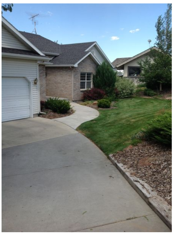
Exterior (siding, roof, lawn, flower beds) in...