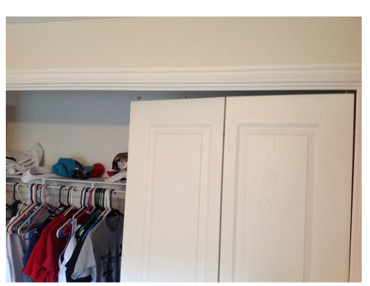
Doors/Locks in Inspection Checklist