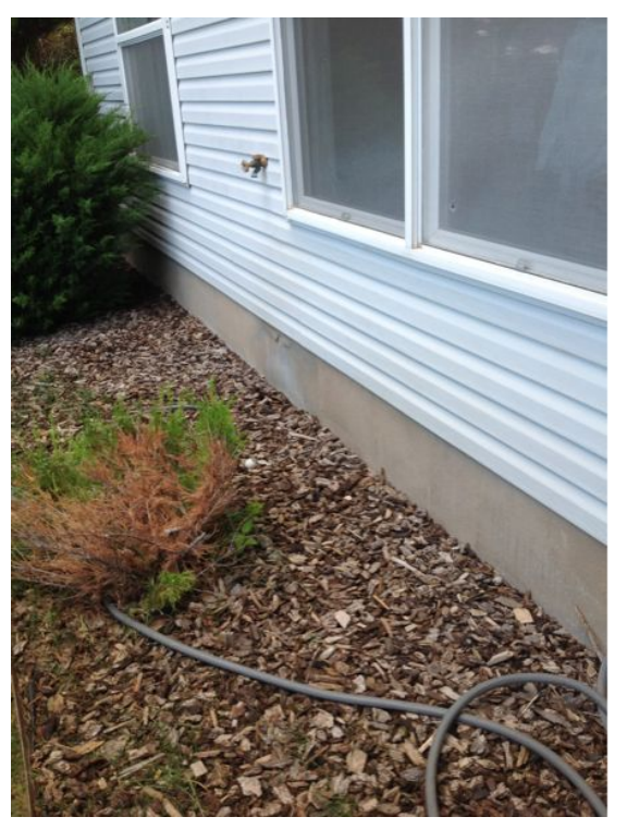
Other issues in Inspection Checklist